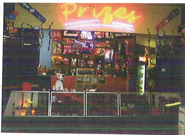
Rhode Island Novelty spent a full day reorganizing and setting up the redesigned redemption counter at Bob-O's.