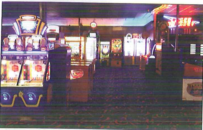
Approximately 1,000 people visit the Bob-O's FEC each Saturday. The game room measures 2,400 square feet, including the redemption prize center and a snack bar.

design his game zone and directly purchased 40 new and refurbished redemption and arcade games.