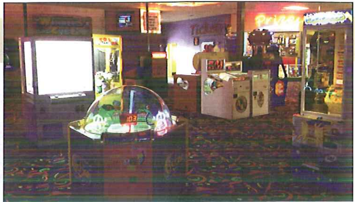
Bob-O's in San Antonio pursued a recent game room remodel that involved opening up the space and bringing in 40 location owned-games. The FEC previously worked with a route operator, but now buys games itself.