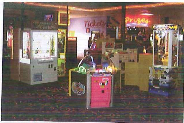
Bob-O's game zone redesign included the removal of 42 feet of walls and 98 feet of display shelving around the perimeter in order to give the area a more open feeling.